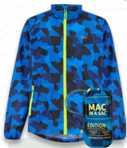
BLUE CAMO XXS-XXXL