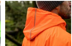
Volume Adjustable Hood with Reflective Detailing