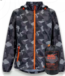
BLACK CAMO XXS-XXXL