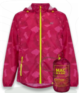
PINK CAMO XXS-XXL