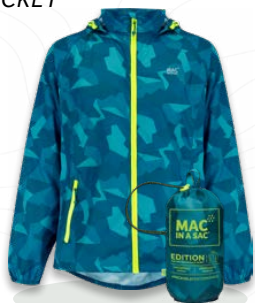
TEAL CAMO XXS-XXXL

PACKABLE WATERPROOF AND BREATHABLE JACKET