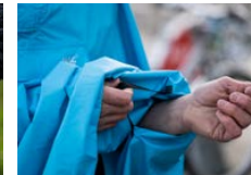
Cycle Wrist Straps