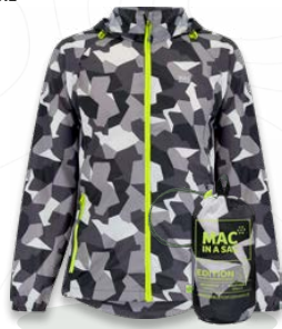
WHITE CAMO XXS-XXXL