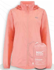
SOFT CORAL XXS-XXL